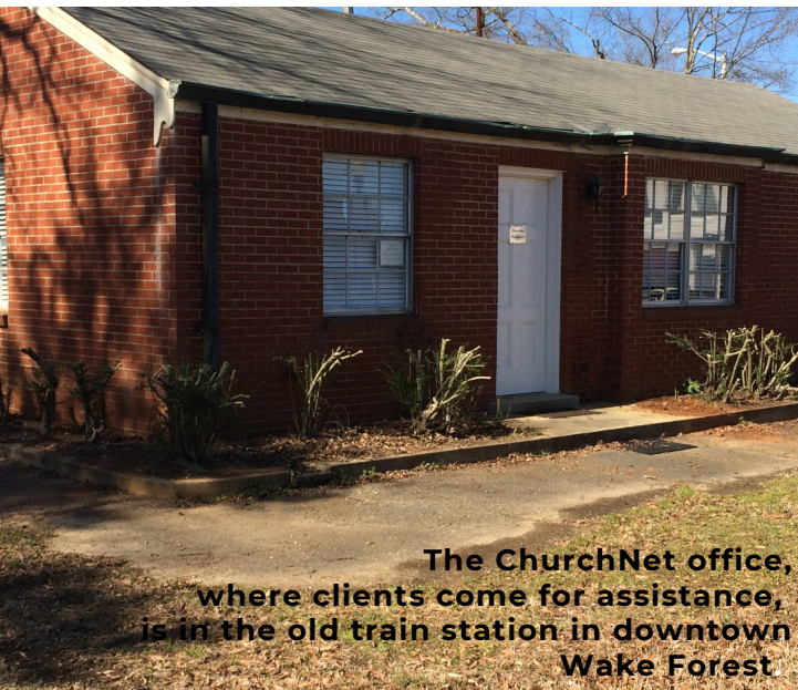
The ChurchNet office, where clients come for assistance, is in the old train station in downtown Wake Forest.