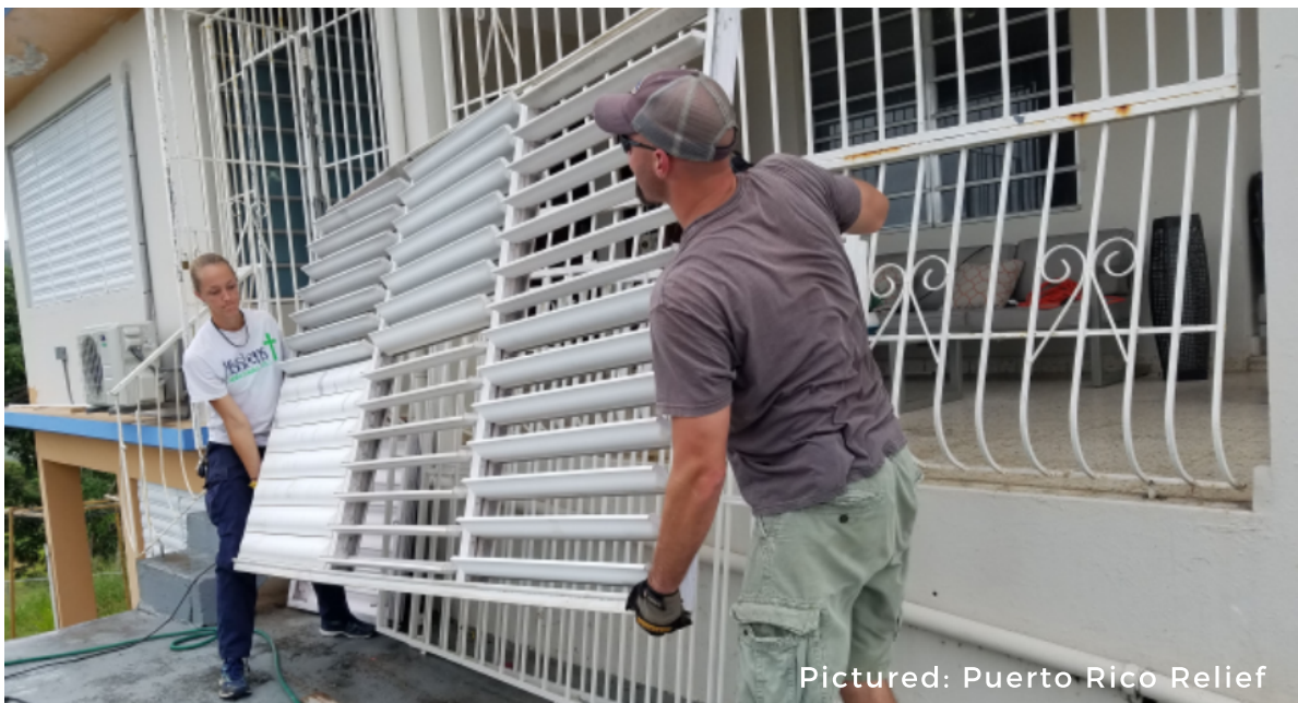
Pictured: Puerto Rico Relief