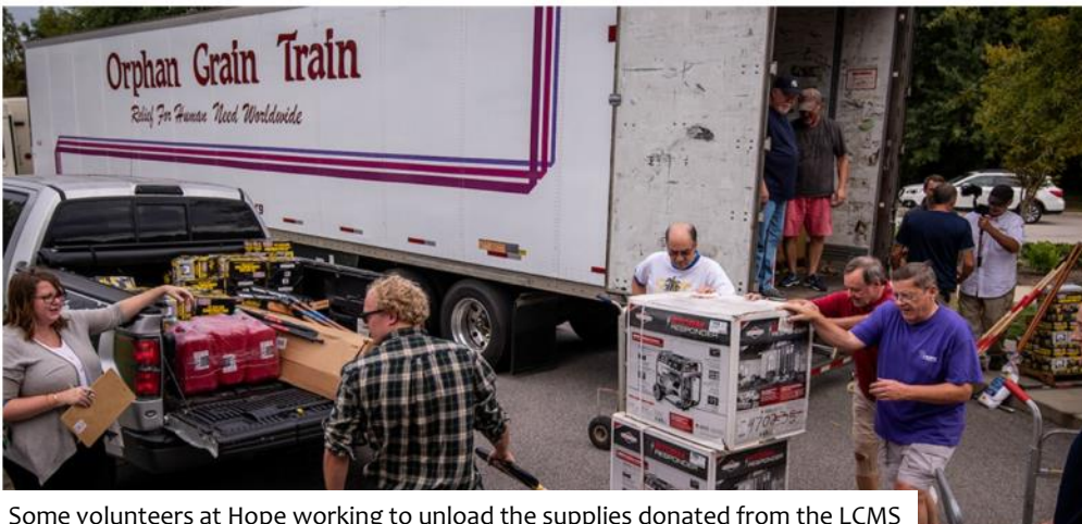
Some volunteers at Hope working to unload the supplies donated from the LCMS

The Lutheran Church— Missouri Synod, the LCMS Southeastern District, and Hope Lutheran Church are working together to bring physical assistance and Gospel hope to disaster victims in North Carolina.