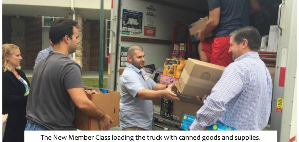
The New Member Class loading the truck with canned goods and supplies.