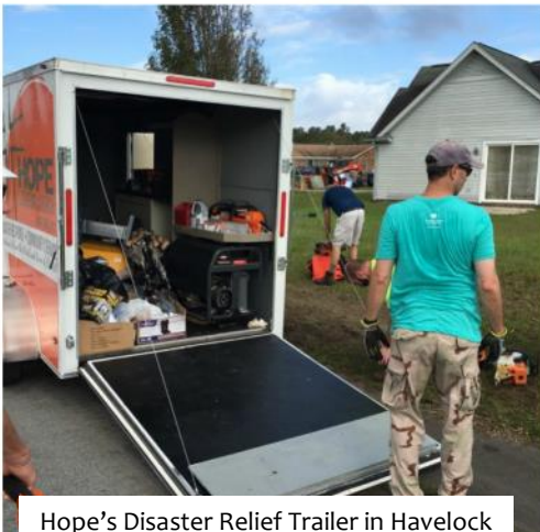
Hope's Disaster Relief Trailer in Havelock