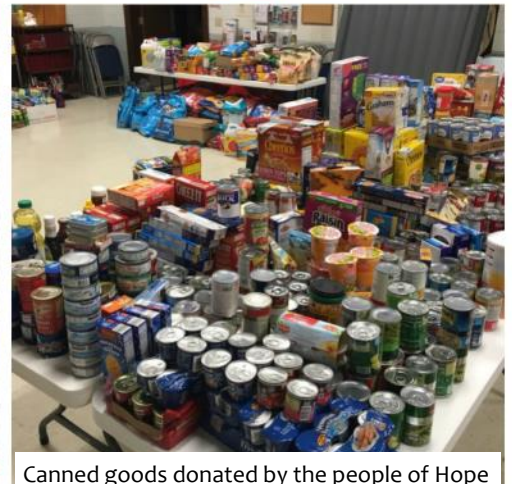
Canned goods donated by the people of Hope