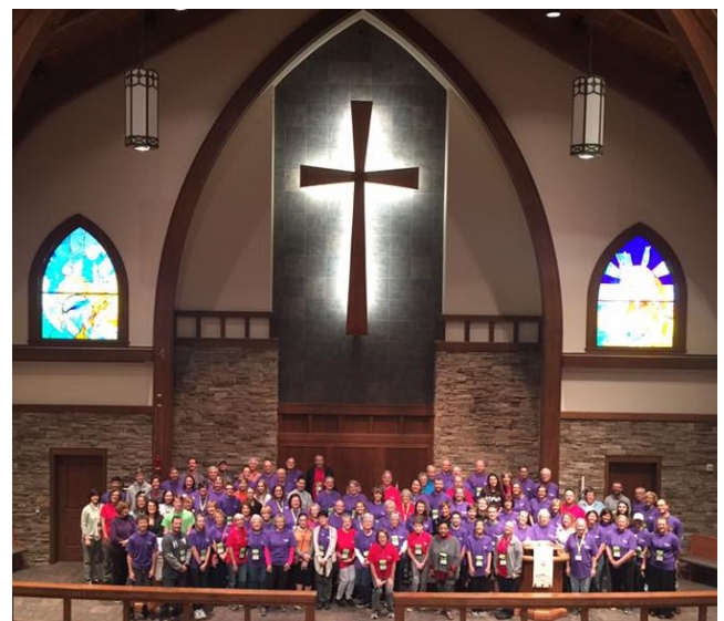
2017 Touched By Hope Volunteers

Women of the Word (WOW) Small Group will be collecting gently used children's books and children's Bibles every weekend in October. These books will be distributed to guests attending the events. Donations may be placed in the gallery collection bin. For larger donations or questions, contact Judy Compton at judygcomp@earthlink.net .