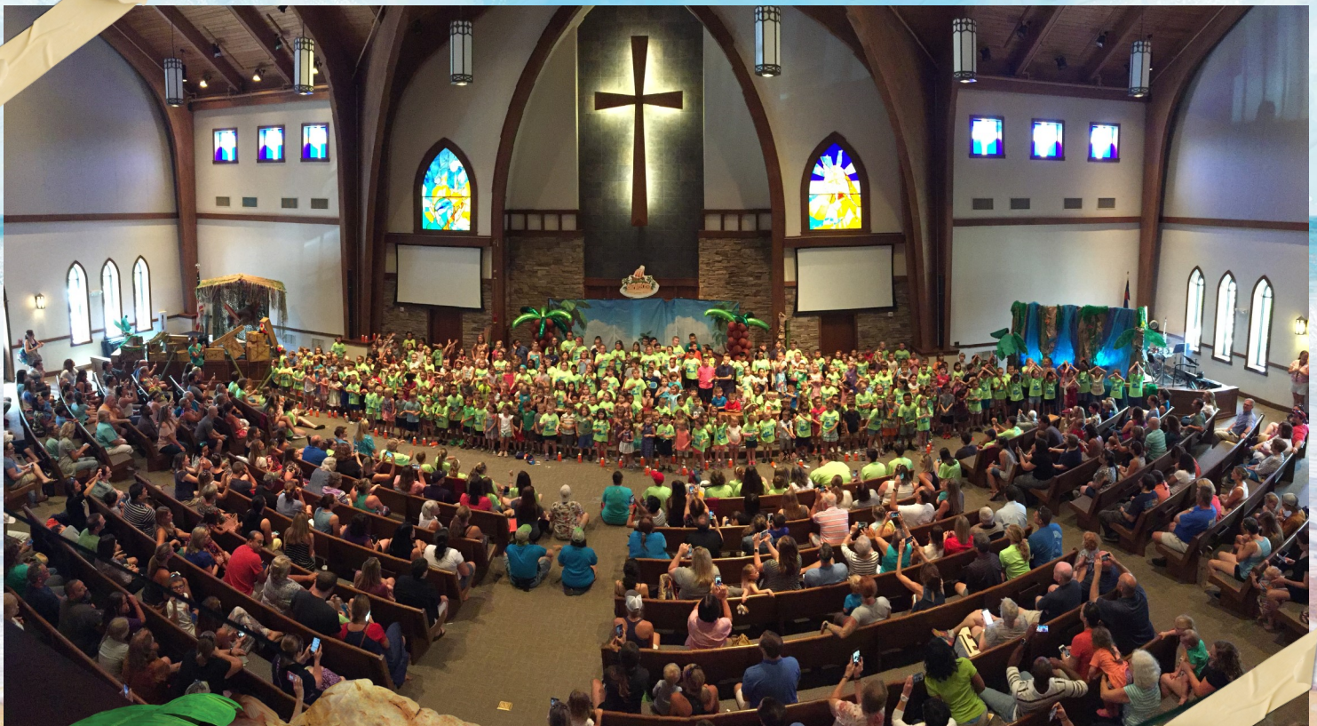
Pictured above: Closing ceremony for the older kids at VBS