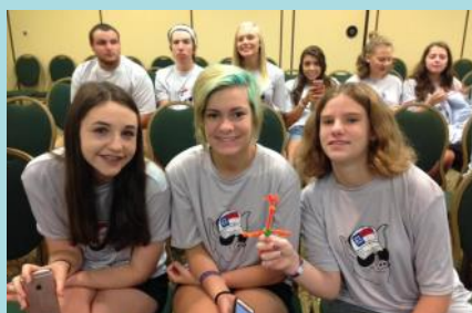
Waiting for the Bible study to begin