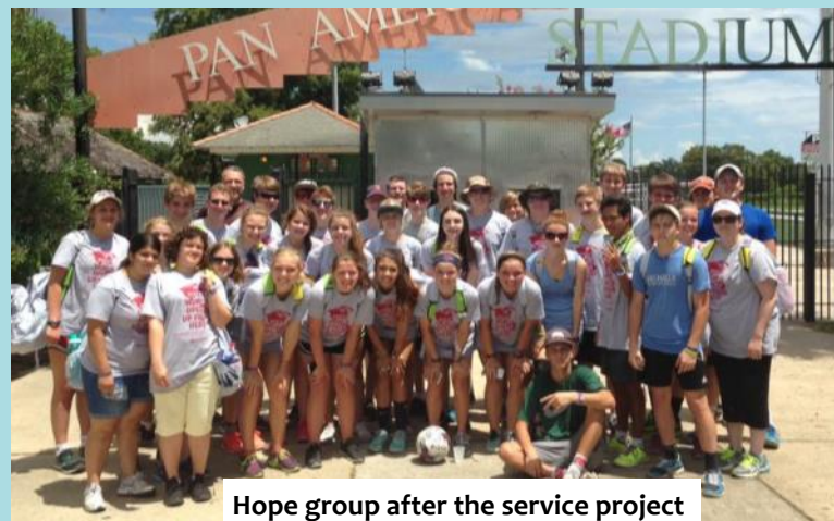
Hope group after the service project