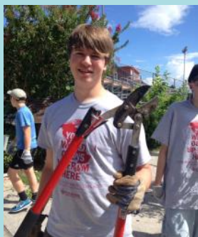
Serving in New Orleans