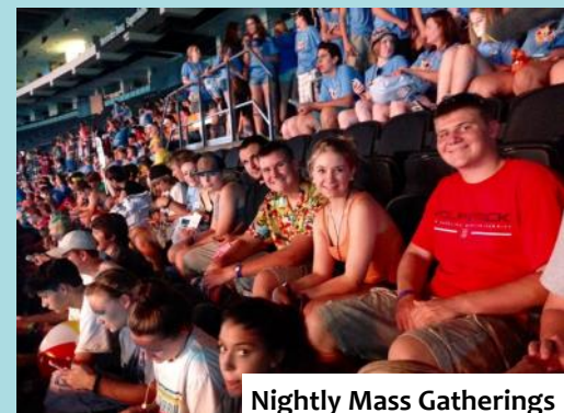
Nightly Mass Gatherings