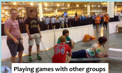
Playing games with other groups